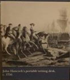
John Hancock's portable writing desk, c. 1750.

The British army leaves Boston, March 17, 1776. American military strategists studied what nearly a year of siege by surrounding American troops.