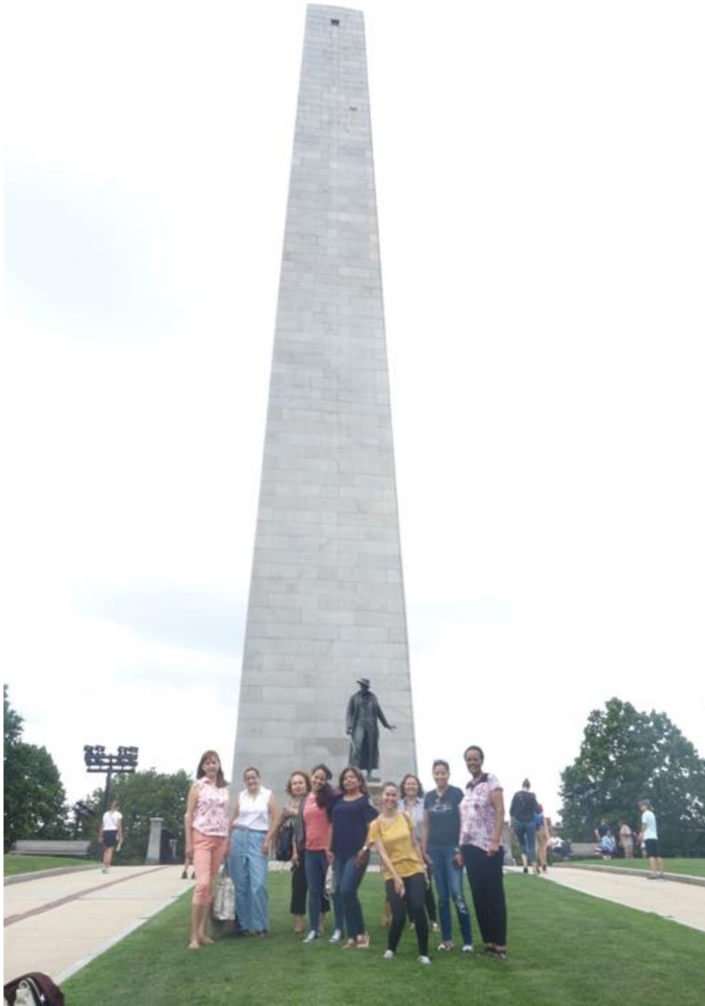
Trip to the Bunker Hill Monument