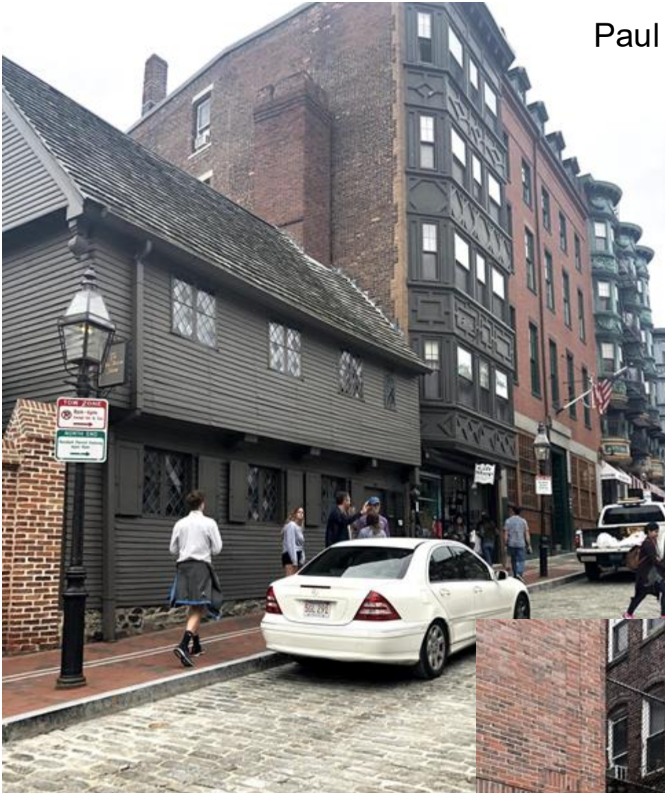
Paul Revere's House

“I will come back to visit Italian restuarants”